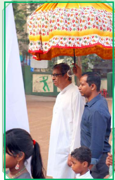
Colourful Ceremonial Umbrella