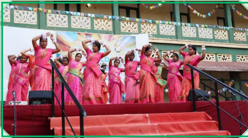
Tribal Adivasi women of the Queen of the Family Community