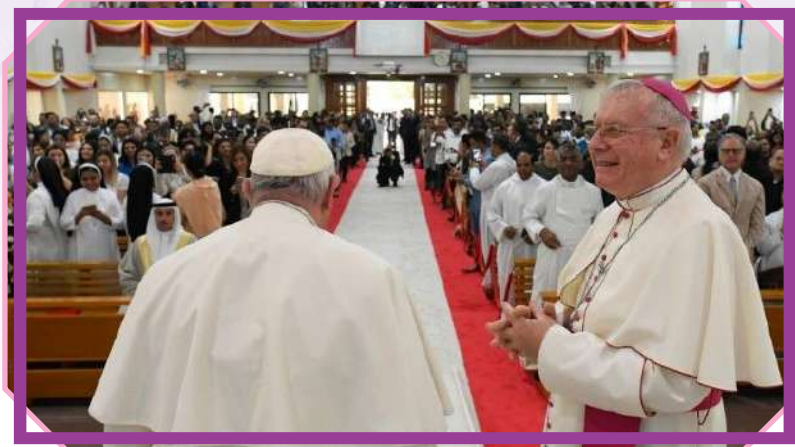
Pope at Sacred Heart Church

On Day Three , he met with young people at Sacred Heart School in Awali and told them, “We need your creativity, your dreams and your courage, your charm and your smiles, your contagious joy and that touch of craziness that you can bring to every situation, which helps to break us out of our stale habits and ways of looking at things.”