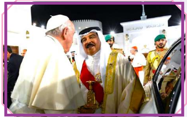
Pope welcomed by King Hamad bin Khalifa

On Day One , he addressed the civil authorities and diplomatic corps of Bahrain . He covered major issues - the Global labour crisis, Caring for the environment, promoting Peace not war, Living together in harmony and respect.