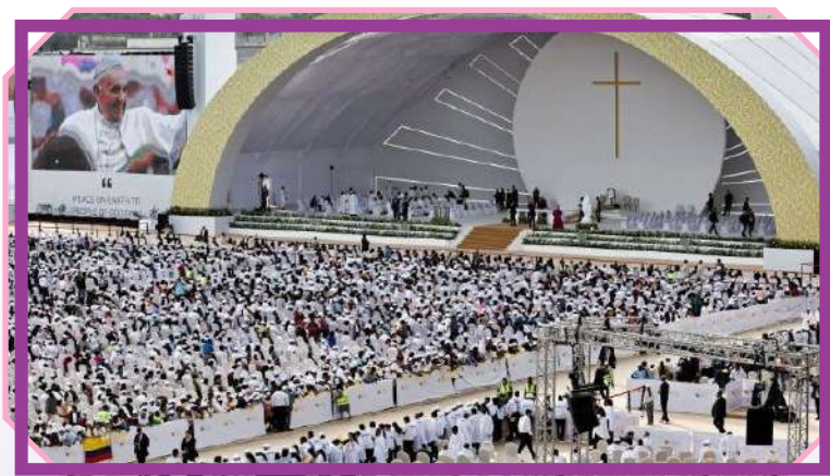
Mass at National stadium

Pope Francis celebrated Mass at 8 am in Bahrain's National Stadium. People traveled from surrounding countries, starting very early in the morning to be there for the Papal Mass. The Stadium was packed to the gills with an audience representing 111 nationalities, Catholics mostly and a few non-Catholics as well. Pope Francis urged the faithful to shatter the chains of evil and break the spiral of violence by loving everyone... always.