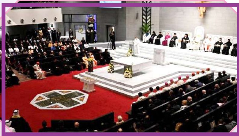
Meeting with other religious heads

On Day Two , He attended the closing session of the Bahrain Forum for Dialogue with over 200 religious leaders in the morning at Sakhir Royal Palace. He spoke out against war and on behalf of true religious freedom, recognition of women, protection of children's fundamental rights, and the concept of citizenship. In his meeting with the Muslim Council of Elders , he encouraged the members to embrace fraternity, prayer and common efforts to help humanity rediscover the hidden sources of life, foster peace and promote care of the disadvantaged in society.